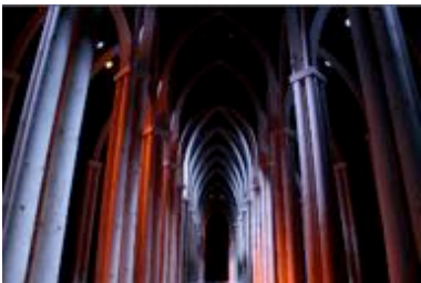
Show Thierry Mugler. Paris, March 2011