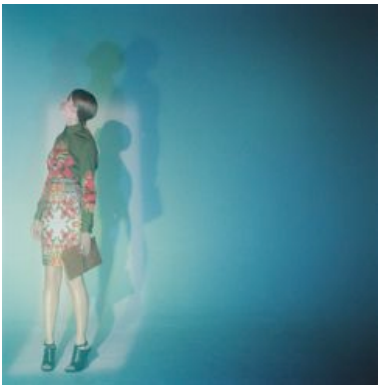
Two of the luminous sets created for the fashion portfolio of Wallpaper* - Paris, Nov. 2011

The following year, during Art Basel , Thierry Dreyfus unveiled his “Hommage ♂” table: spotted by Pierre Gandini, head of FLOS , it was soon transformed into a luminous crack named “Wall Rupture”, and launched during EuroLuce 2011.