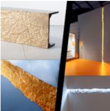
« Hommage » Table (2010) et wall Elément de Lumière « Rupture » (2011)