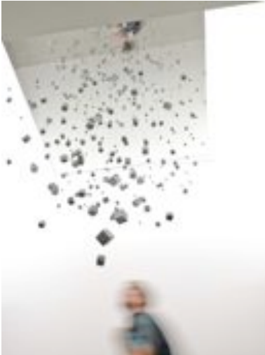
“Nuage I - Offrez-moi votre silence” : exclusive suspension at the Carpenters Workshop Gallery - 2009