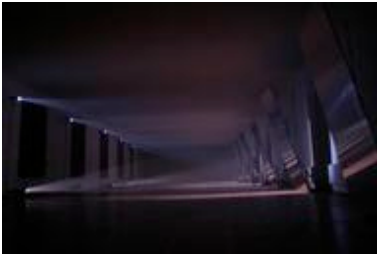
One of the 14 installations for Louis Vuitton catalogue "Icons". Paris - 2006