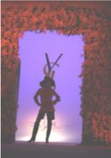
Yves Saint Laurent's 40- Anniversary show Centre Pompidou, Paris - 2002