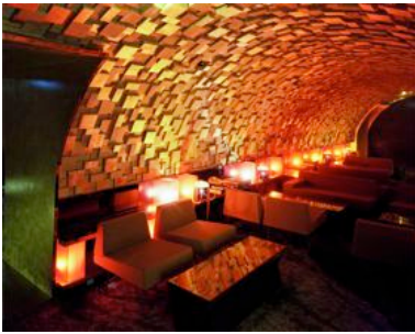
Set of light atmospheres for the Club Silencio, Paris - Oct. 2011