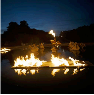
“L’Eau à la Bouche” : Installation for “Versailles Off”. Château de Versailles - 2006