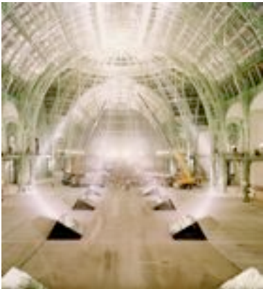
“MR7 Ondes Visibles” Installation for the reopening of the Grand Palais. Paris - Sep./Oct. 2005